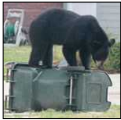
Secure trash in bear-proof containers

What regularly brings them to the vicinity of our houses and camps is a single-minded pursuit of sustenance (food and water). Depending on the season and size, bears need to eat up