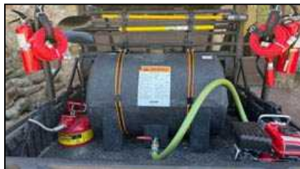
Fire Scat: 60-gallon mobile water tank and 5-gallon backpack pumper for spot fires

Safety is always at the forefront of EMC sponsored events. Training is required for wood chipper operators, a safety officer is assigned, a traffic monitor is present, and a compact water tank with pump is kept onsite in case of fire. Due to severe drought conditions, wood chippings are doused with water from the Fire Scat as a safety precaution. The Fire Scat is a portable firefighting device engineered by Brad Brooks. The mobile water tank with pump and hose may be used to suppress low-level fires until local firefighters arrive on scene.