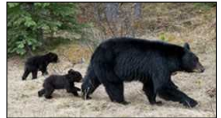
Mama bear will defend her cubs. Steer clear!