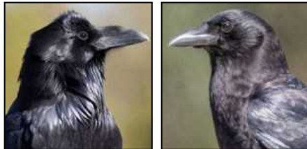
The beak on a raven (left) is thick and curved. The crow (right) has a slender beak.

The Common Raven and American Crow are members of the Corvidae family and both are common throughout Colorado. It is easy to confuse these birds as they are similar in appearance - both are entirely black, including their feet and beak, but the similarities end there. Look at the pictures below. You may notice the beak on a raven is thick and curved, while the crow displays a slender and